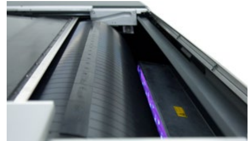
Inline UV2 exposure makes flexo platemaking fully digital

The Inline UV2 digital main exposure now makes flexo platemaking fully digital. Human errors are reduced and the plate consistency is boosted.