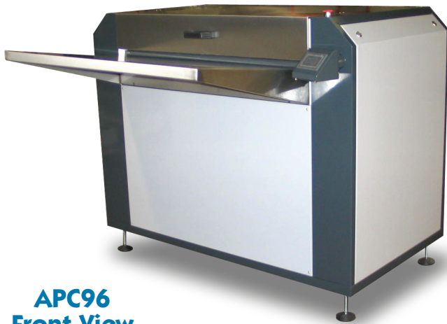
APC96 Front View

We believe that a more “hands free” approach to photopolymer plate cleaning not only offers excellent cleaning capability for hard to clean reverse areas and screens, but also reduces plate damage and offers unsurpassed consistency in cleaning as well. Designed for efficient automated cleaning of either letter-press or flexo plates, this unit is designed to automate and improve productivity and performance. The process steps are simple; the APC units clean, rinse, and dry the plate in-line.