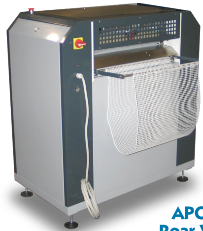
APC45 Rear View