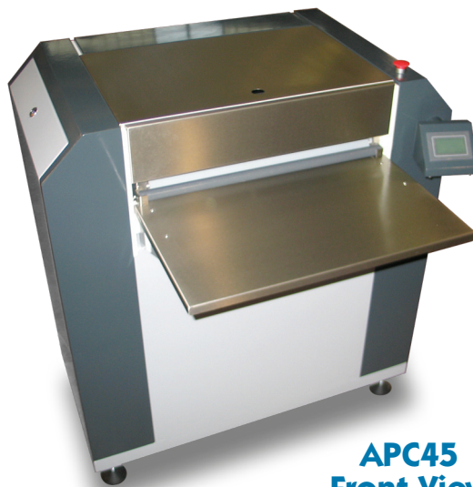
APC45 Front View

"The APC45 Automated Plate Cleaner we purchased from APR has been exceptional. Everyone loves it. Plates are now cleaned, rinsed, and dried much quicker, better and more consistently than when our operators hand-washed them. They simply feed plates into the machine and go about their other duties as plates are cleaned and ready to be stored for the next press run.