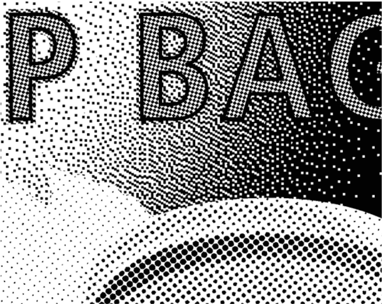
Example of a single separation containing multiple types of screening (circular, square and Monet).

The standard version of Adobe® Illustrator® can only provide one set of screen parameters (angle, ruling, dot shape) per ink/separation. screenX is a plug-in tool for Adobe Illustrator that allows object-based components to have multiple rulings and/or multiple angles or screening technologies within a single separation. The use of these mixtures is quite common in packaging jobs. screenX can also be used as a tool to apply specific DGC (Dot Gain Compensation) settings, a utility supported by the EskoArtwork FlexRip and the Agfa Apogee workflow systems.