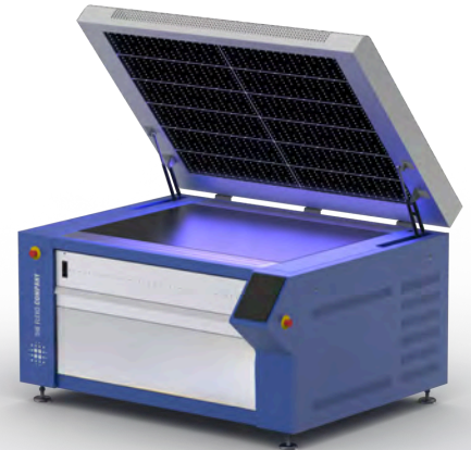
Xpro M-ELF Exposure LED + Fluorescent Lamps Light Finisher